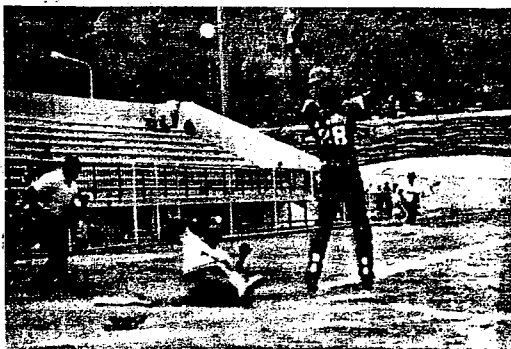
Throw is high as member of Panama team scores against Venezuela in the Pan American Games. Panama placed third to win the bronze medal.

Women's Central American-Caribbean Championship Guatemala City, Guatemala